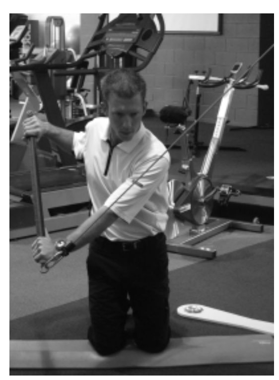
Figure 3. The chop pattern performed in tall kneeling with tubing resistance and stick.

coordination, vestibular, etc.) with little external input. The authors of this article prefer the term "transitional postures" to describe the two kneeling postures. These transitional postures will be emphasized due to their ability to stress or recruit the smaller stabiliz-