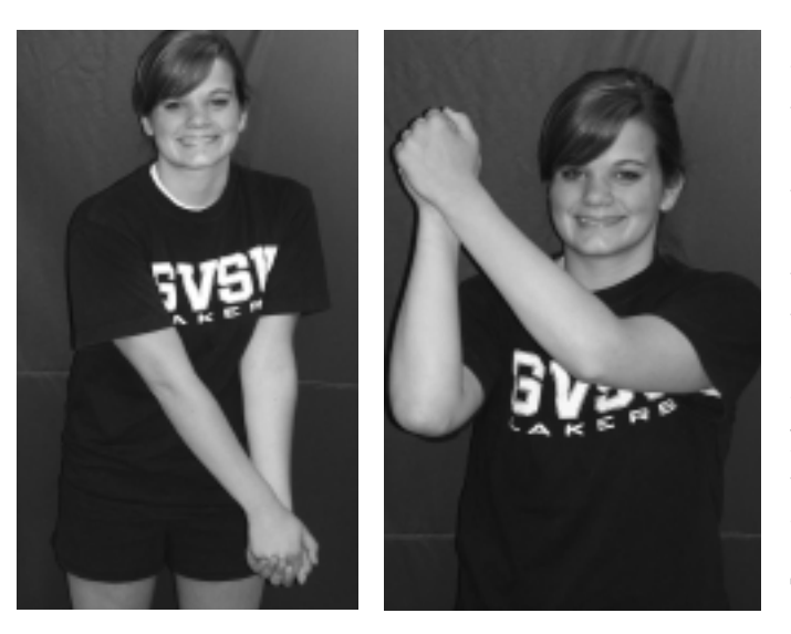
Figures 1A and 1B. The traditional PNF lift pattern, 1A: Start position, 1B: Finish position.

itation for many years with additions of manual resistance, weights, and elastic resistance in a variety of positions (supine, sitting, standing, etc.). The chop and lift patterns are applications of the upper extremity diagonals that involve the use of bilateral upper extremities. One upper extremity is performing the diagonal one pattern, while the other upper extremity is performing the diagonal two pattern, either both moving into flexion, "the lift" (Figure 1A) or extension "the chop" (Figure 1B) while using