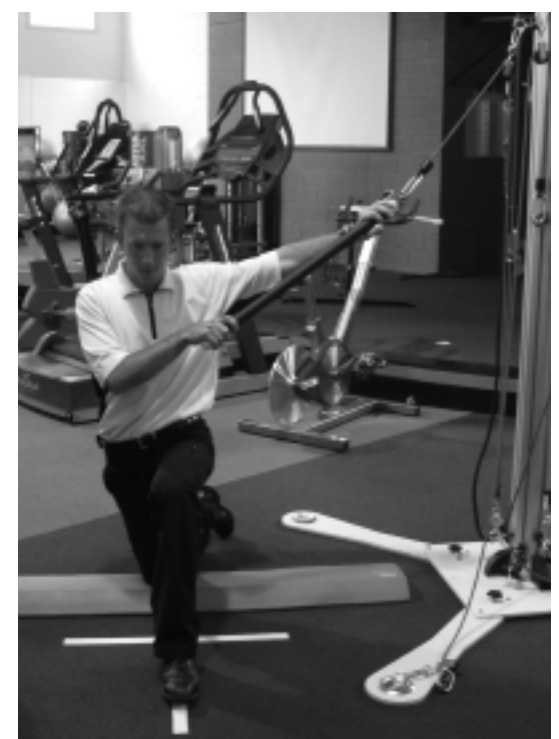
Figure 7. Half kneeling chop showing the use of floor tape for consistent alignment of the lower extremities during assessment.

A common a mistake in the halfkneeling chop is flexion at the hip or in the trunk. Throughout the entire