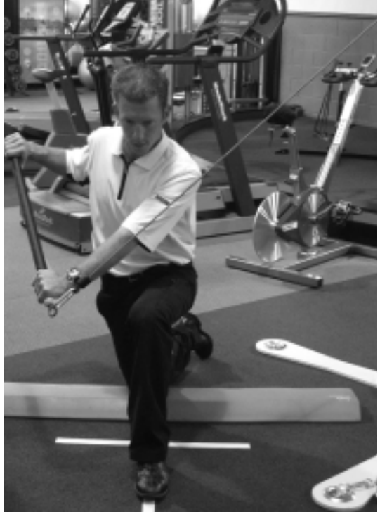
Figure 2. The chop pattern performed in half kneeling with tubing resistance and stick.

core either for mobility or stability. When a destabilizing force acts on the trunk, a proper temporal and spatial recruitment of the core musculature is required to protect the spine.<sup>3,4</sup> Research has shown that when a limb is used to challenge the position of the body, a reactive force is produced within the body that is equal in magnitude but opposite in direction to the forces producing the destabilizing movement.<sup>5-8</sup> In other words, when the shoulder girdle and upper extremity moves in a diagonal chopping movement pattern, the destabilizing force acting on the center of mass is anterior causing the trunk to flex. The reactive stabilizing force (reactive strategy) is downward and backward to counteract the trunk movement. If these forces are equal or balanced, no net move-